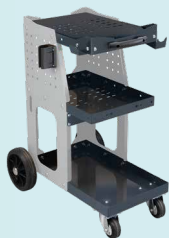
Spot 800 trolley ref. 051331