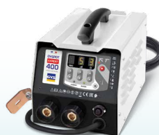
PROLINER PRO 230 - ref. 035799 PROLINER PRO 400 - ref. 035805