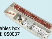
Steel consumables box ref. 050037