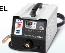
PROLINER 39.02 - ref. 035775 PROLINER 39.04 - ref. 035782