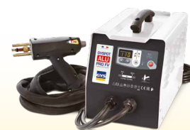
PROLINER ALU PRO FV - ref. 035836