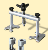
Alu Puller ref. 051003